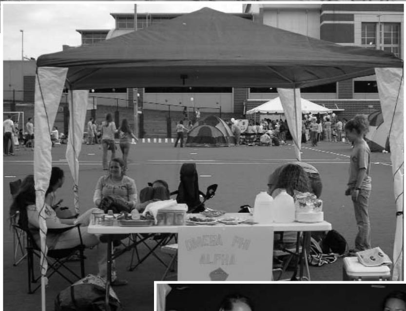
Sisters prepare for our bake sale and a long night of walking.

The night began with a moving and motivating opening ceremony where we heard stories from cancer survivors and learned that the campus had already raised $43,000! The survivors made the first enthusiastic lap around our Campus Recreation Center's field to officially begin the relay. The sisters took turns walking in pairs. When we weren't walking, we enjoyed visiting the various fundraisers around the field, listening to the live music from campus performers, playing board games and bonding.