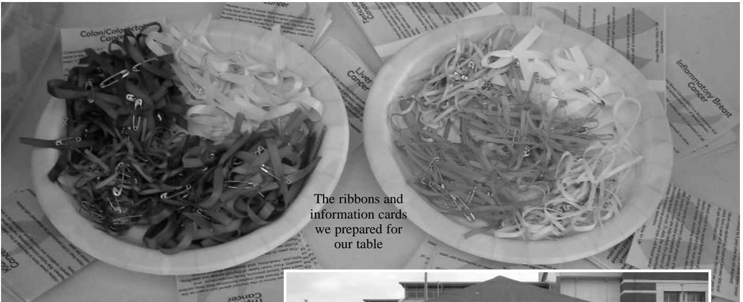
The ribbons and information cards we prepared for our table