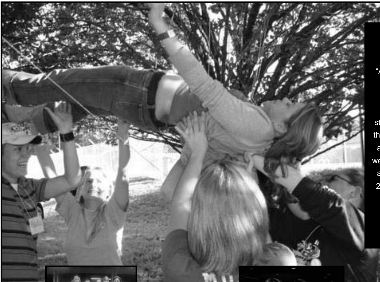
"Alpha Delta Chapter (Georgia Southern) strengthened their bonds in a teamwork web challenge at their Nov 2005 colony retreat"

All three new chapters and the KSU Colony will be sending multiple delegates to this summer's Convention in Hartford, CT.