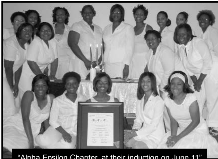
"Alpha Epsilon Chapter, at their induction on June 11"

members, four of them are men. Although Omega Phi Alpha has had male members before, this represents the first time that men participated in the colonization of a new chapter. The four "mister sisters" help form a rich, diverse tapestry in this new chapter, and continue to contribute their enthusiasm and talents to the chapter's success.