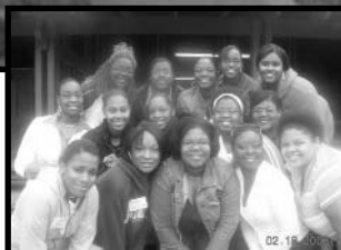
"Alpha Epsilon Chapter (Southeastern Louisiana) braved a multitude of western Louisiana insects at their colony retreat in February"