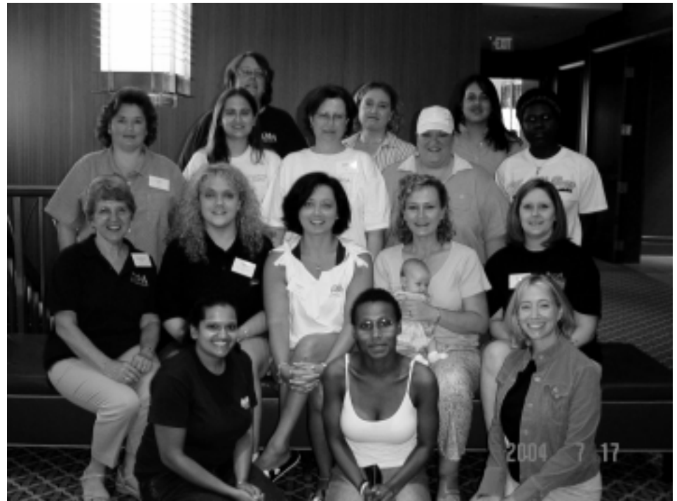
Alumnae in attendance at the Alumnae Business Meeting, Convention 2004